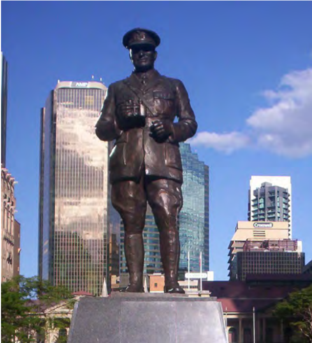
Major-General The Hon. Sir W. Glasgow KCB CMG DCO BD